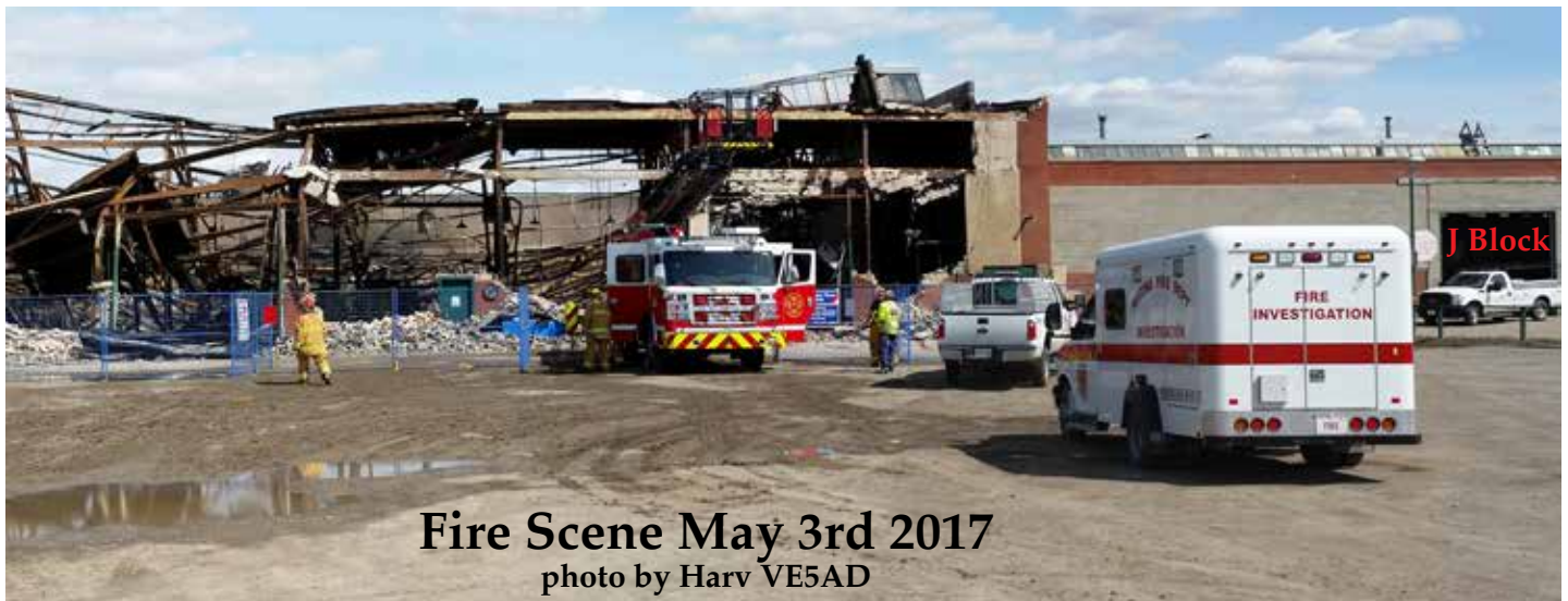
Fire Scene May 3rd 2017

The most important thing is that no lives were lost. In addition, several businesses in the building were left mostly intact by the fire, and we still have our communications truck.