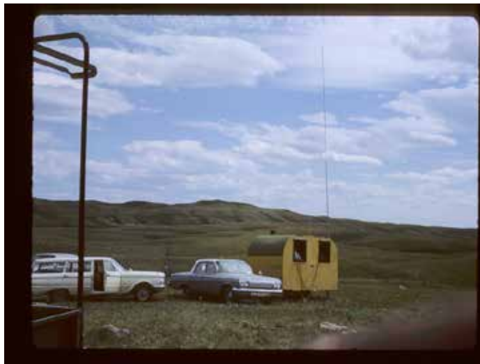
Lionel's trailer that just might blow over in the wind.