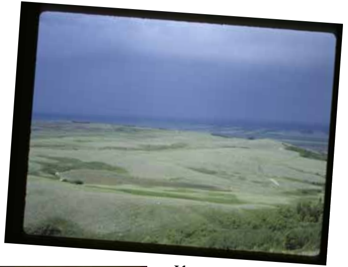
If you look closely, you will notice the First Nation's medicine Wheel in the lower left hand of the picture.