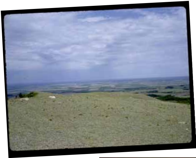
In the distance, you can just see Avonlea.