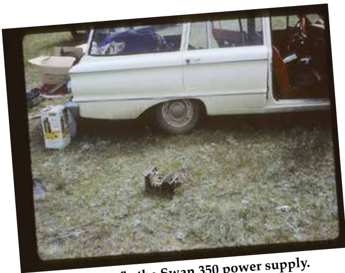
Doug has to fix the Swan 350 power supply. Diodes in the tool box.